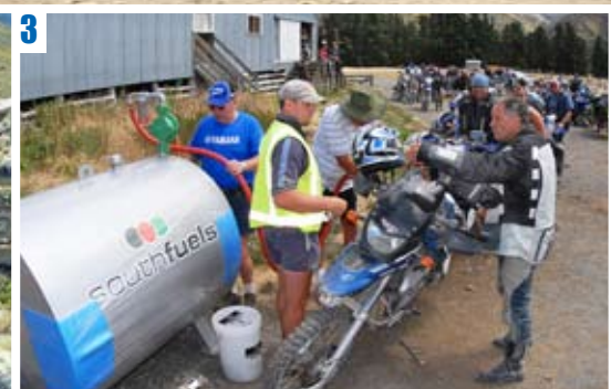
MAIN: The long run north from Hanmer Springs through Molesworth Station offers majestic views like this the whole way. 1. The ranks of pillion riders swelled to nine adventurous couples this year. 2. How many Kiwis does it take to fix a flat front tyre? Looks like the answer is five! 3. Lunchtime refuel on day two, where the fuel had to be trucked in specifically for the Safari participants.