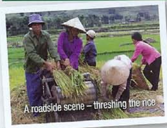
A roadside scene – threshing the rice