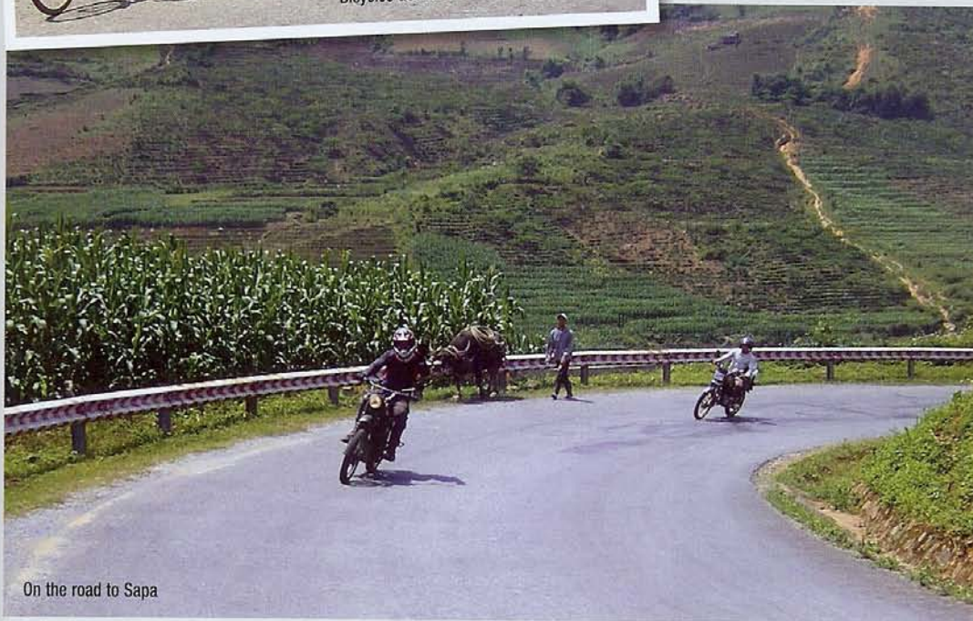
On the road to Sapa

the highlights. Those who are strong swimmers can swim through a hole in the rocks into the centre of a hollow island; for the active, a climb up many steps into one of the spectacular limestone cave systems; and for the inquisitive an opportunity to board one of the many floating fish farms that are the livelihood of the people who live in the bay. Many of these floating homes dot the bay, and there is even a floating school. Fresh seafood is featured on the menu, and we are rocked to sleep by the gentle lull of the water.