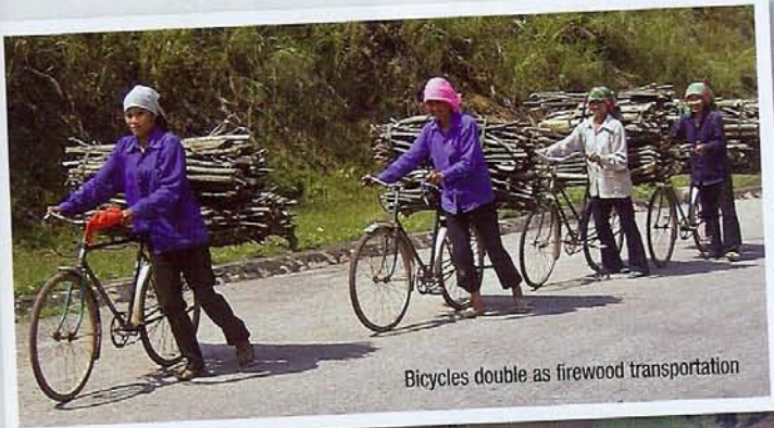
Bicycles double as firewood transportation