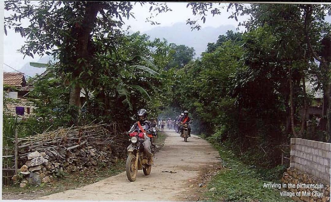
Arriving in the picturesque village of Mai Chau

Britton Motorcycle Adventures Venture Into Vietnam: Hill tribes and Ho Chi Minh Trail Tour starts in Hanoi, a city like no other. It is a curious blend of east and west, family life and traffic madness, capitalism and commu-