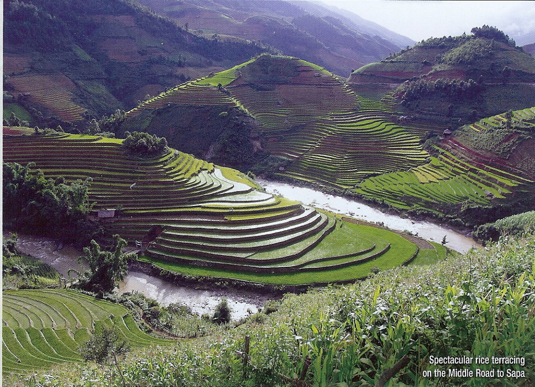
Spectacular rice terracing on the Middle Road to Sapa

The tour starts and finishes in two very different cities Hanoi and Saigon (now known as Ho Chi Minh City). Both are fascinating; Hanoi, more traditional; Saigon, with its long history of French and American influence. Also in the tour itinerary is the historic city of Hue. While it played a big part in the January 1968 Tet Offensive, a famous battle in the Vietnam War, Hue is a city with a